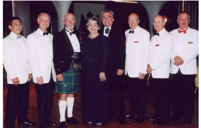
2002 QE2 SAILING

Newly announced ... a reversal of policy for the Caronia . Cunard's Caronia will resume inviting two USA and two UK Hosts on the ship for 2003. The QE2 will continue with three USA and three UK gentlemen, now a total team of 6 GHs for each sailing and all eyes look forward to the 2004 inaugural year of the Queen Mary II (QM2). Will you be aboard her in '04?